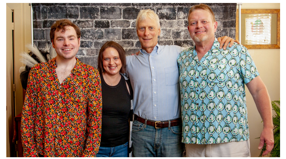
The Detectives Comedy Theatre Cast