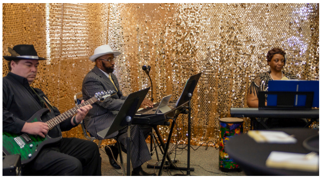
The MSH Jazz & Blues Tric