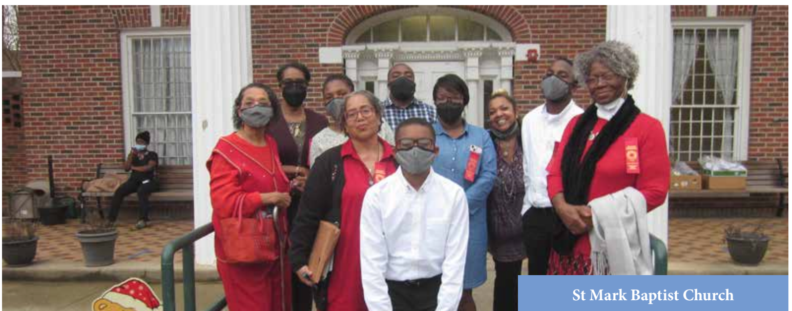
St Mark Baptist Church