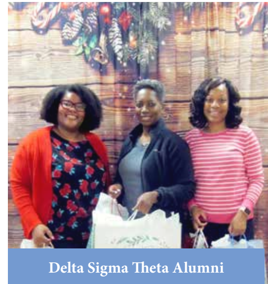
Delta Sigma Theta Alumni