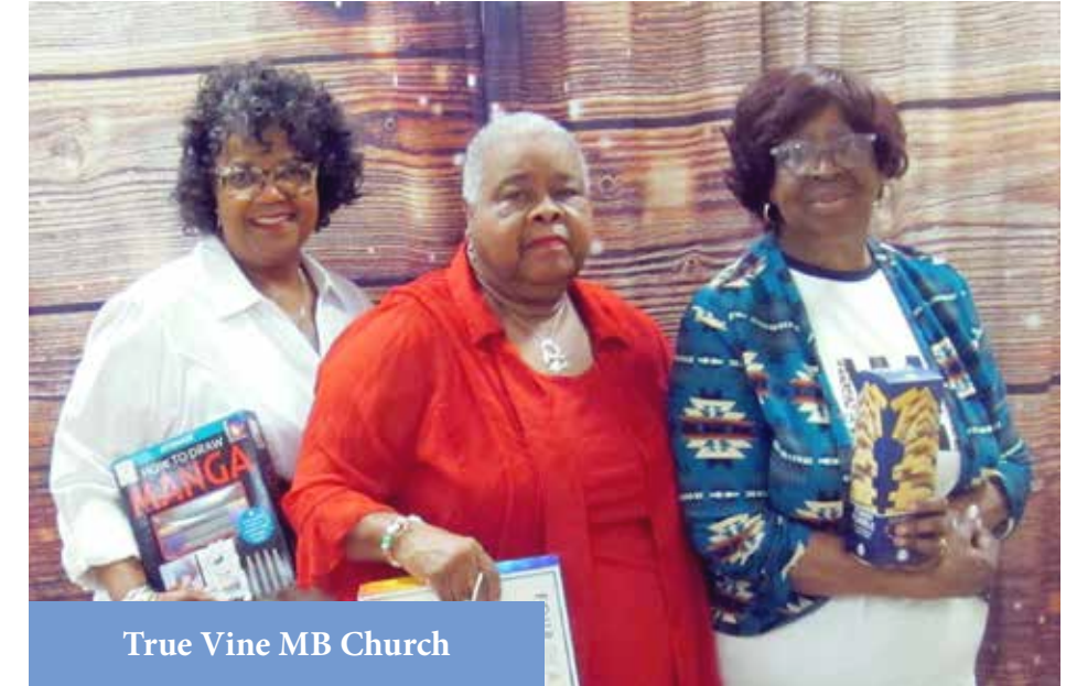
True Vine MB Church