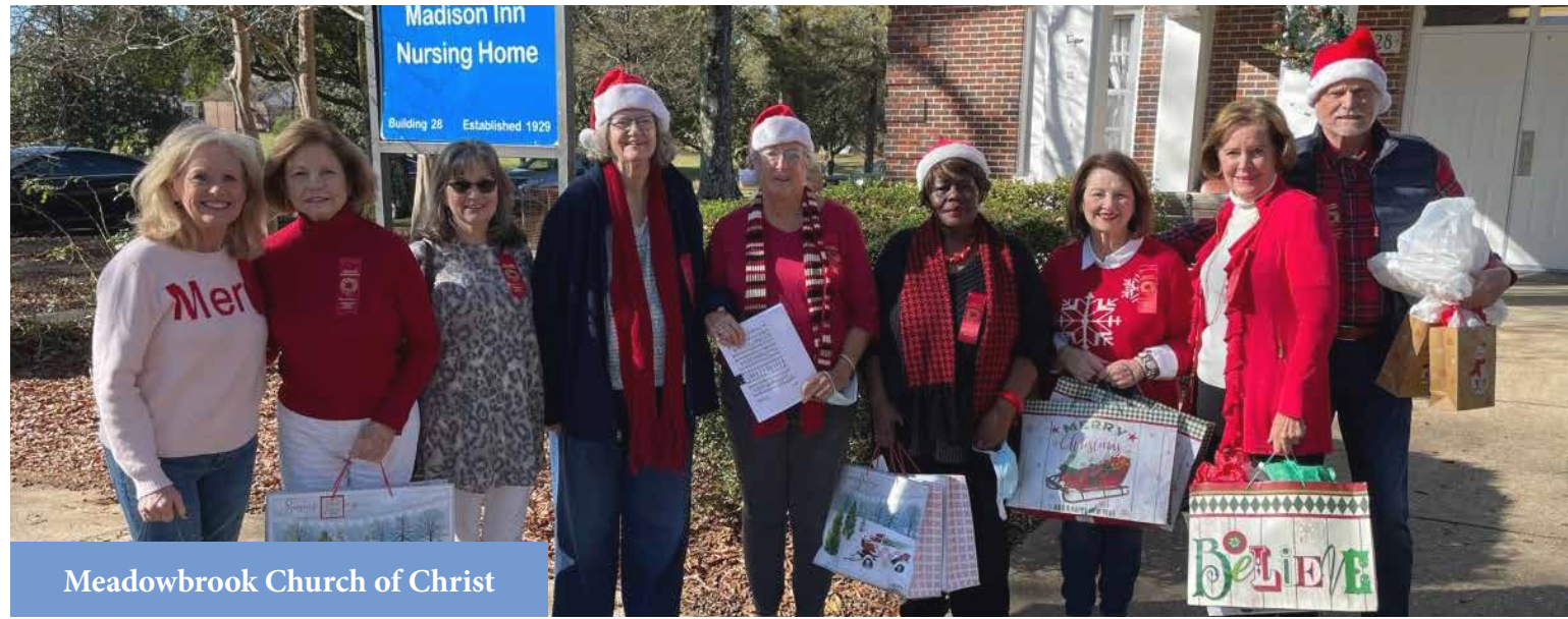
Meadowbrook Church of Christ