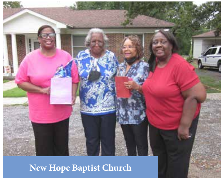
New Hope Baptist Church