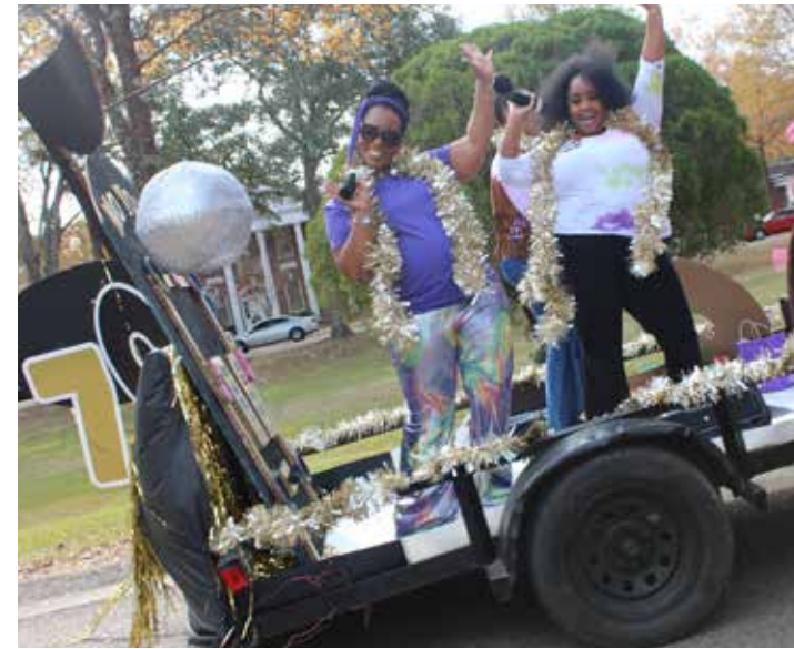
Honorable Mention awarded to Building 36, A Motown 70's Christmas.