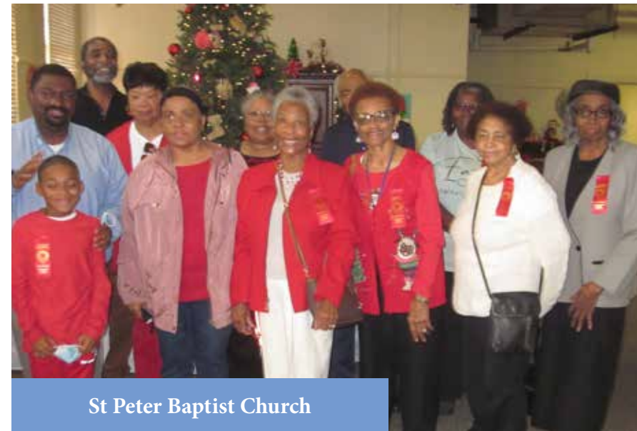
St Peter Baptist Church