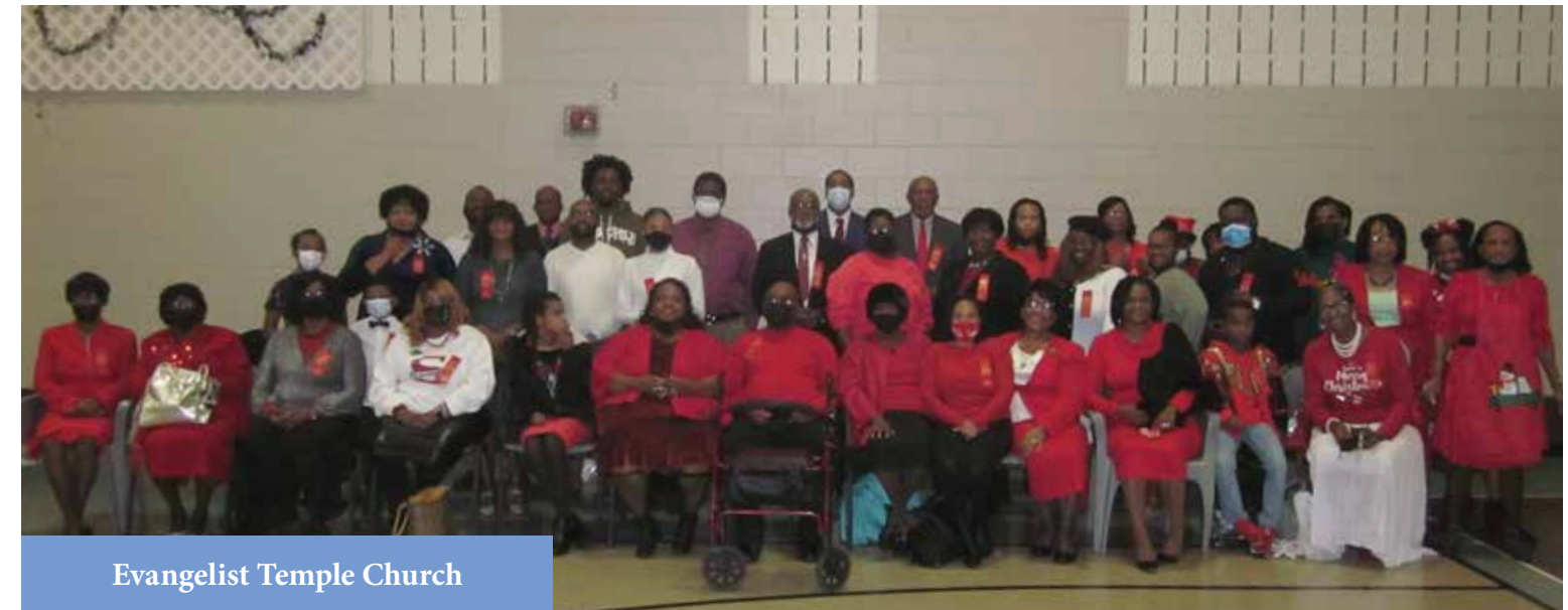
Evangelist Temple Church