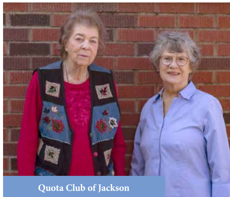
Quota Club of Jackson