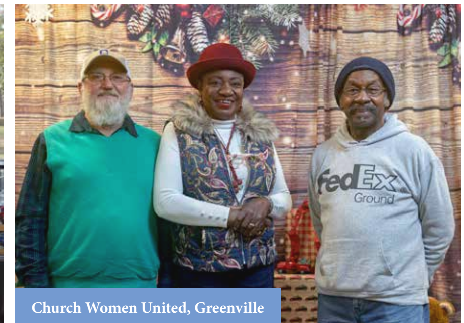
Church Women United, Greenville