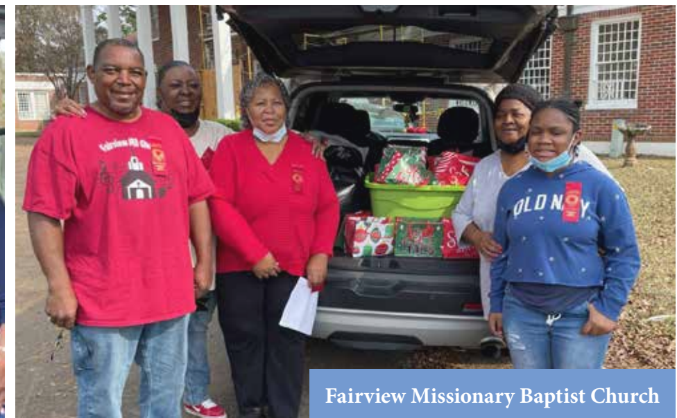
Fairview Missionary Baptist Church