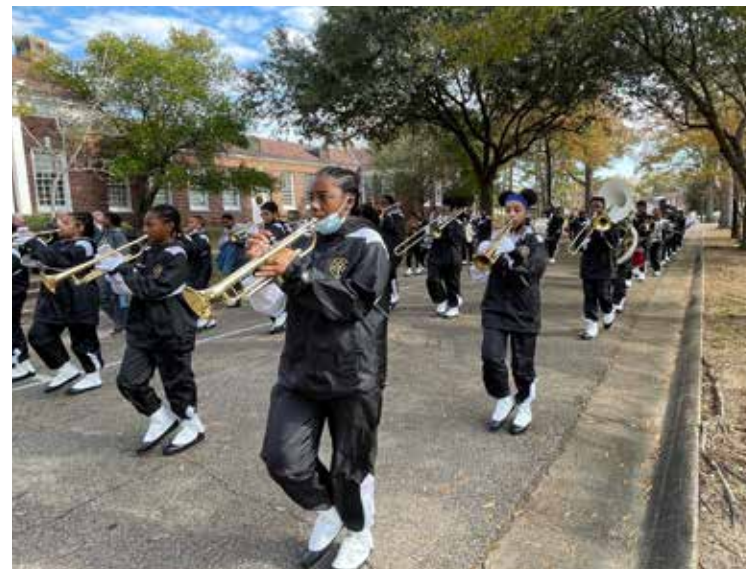
Bailey APAC Middle School and Northwest Jackson Middle School Bands participated in the Mississippi State Hospital Christmas Parade.