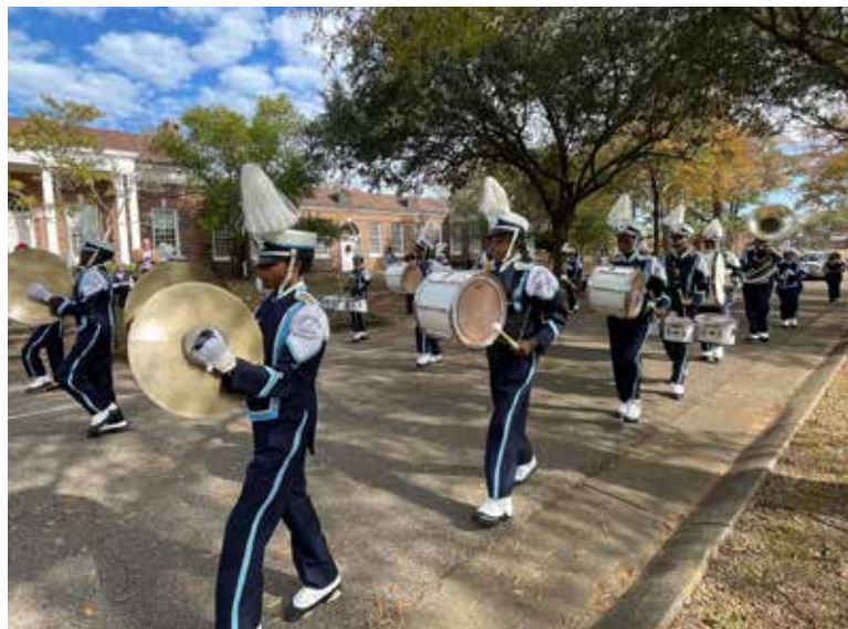
The Canton High School Marching Band entertained the crowd at the Mississippi State Hospital Christmas Parade.