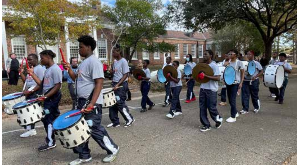
The Brinkley Middle School percussion section performed in the Mississippi State Hospital Christmas Parade.

The Christmas season continued throughout the month of December as volunteer groups visited with patients and residents at Mississippi State Hospital to celebrate and share the Christmas Spirit.