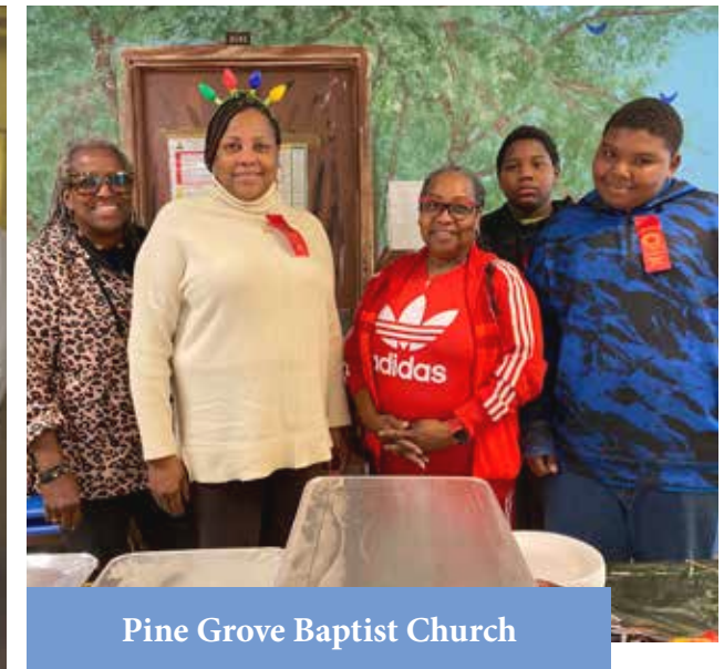
Pine Grove Baptist Church