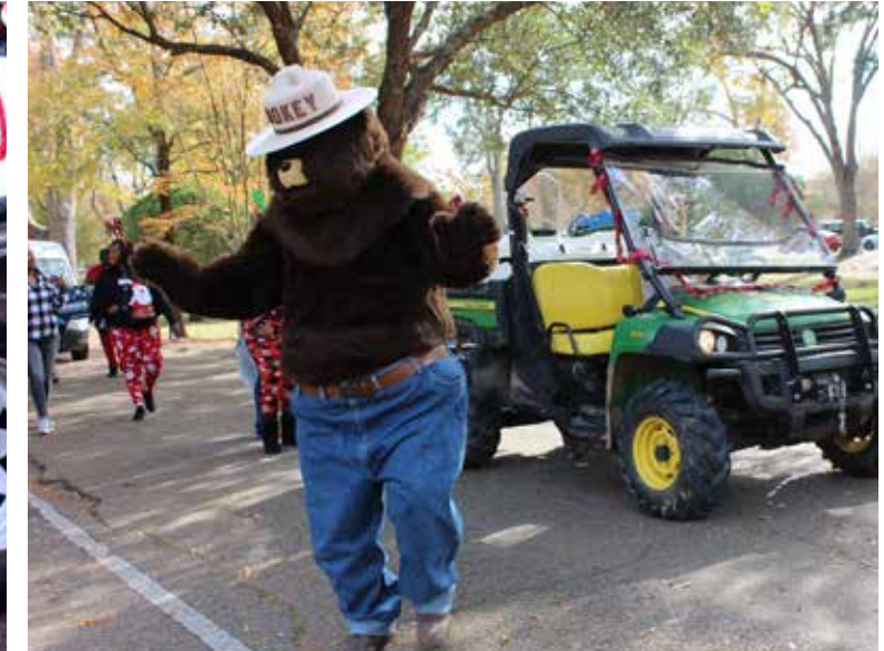
MSH's Holiday Spirit Award went to (HBHS) Hinds Behavioral Health Services, Region 9, Christmas in the Smokies (Most Enthusiastic Participants).