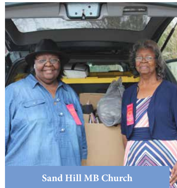
Sand Hill MB Church