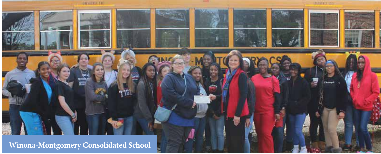
Winona-Montgomery Consolidated School