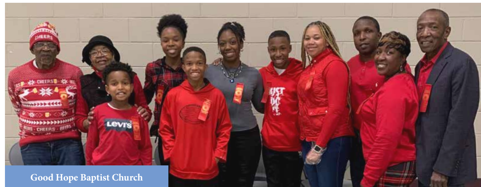
Good Hope Baptist Church