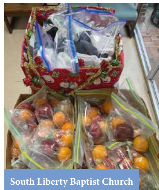
South Liberty Baptist Church