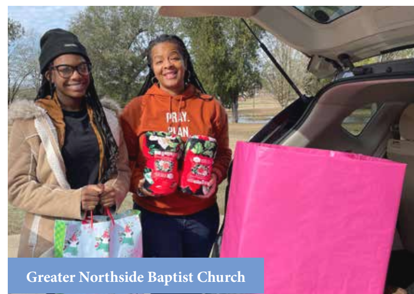
Greater Northside Baptist Church