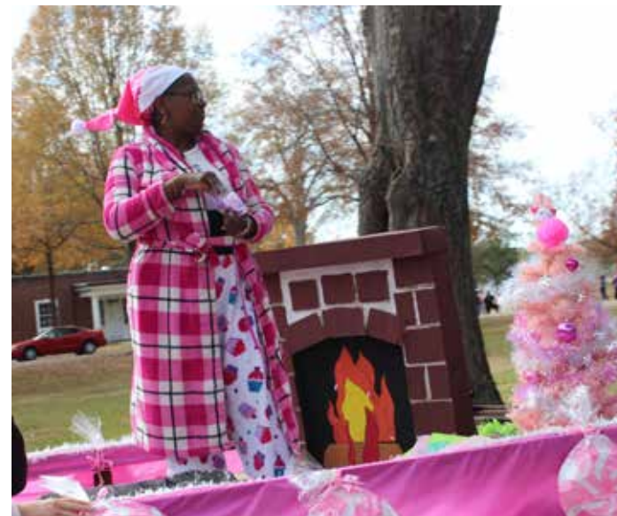
MSH's Ms. Pink Award went to Building 33, Pretty in Pink.