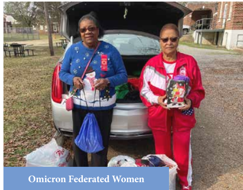
Omicron Federated Women