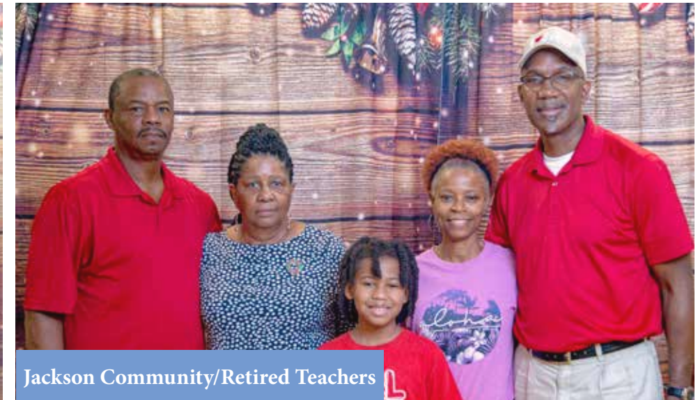
Jackson Community/Retired Teachers