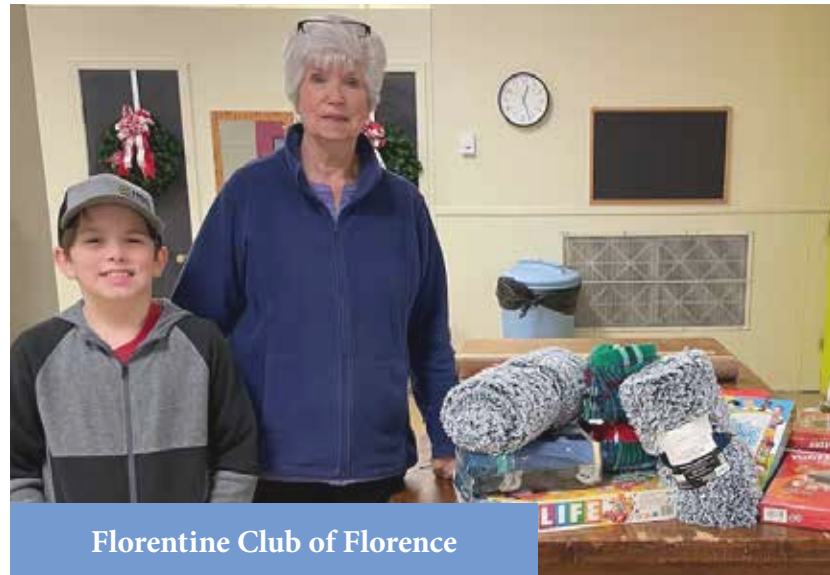
Florentine Club of Florence