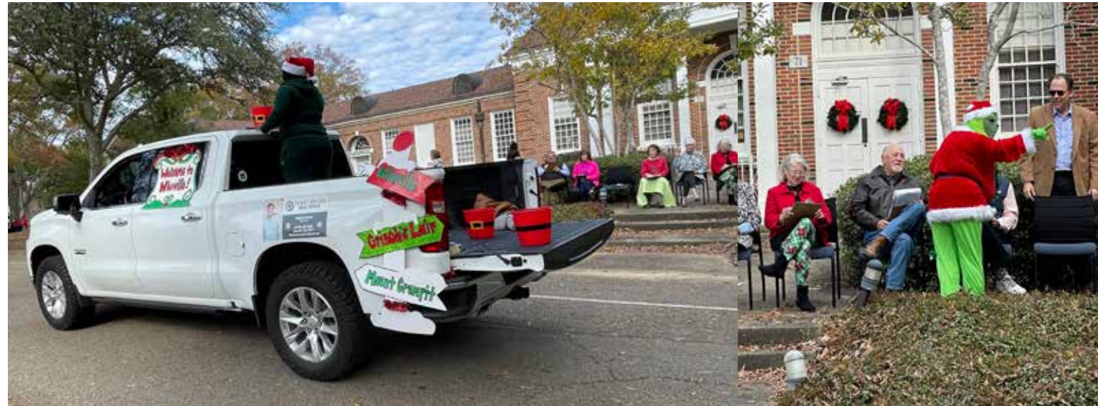
MSH's Tin Soldier Award went to Building 81, Christmas in Whoville (Best marching/walking entry).