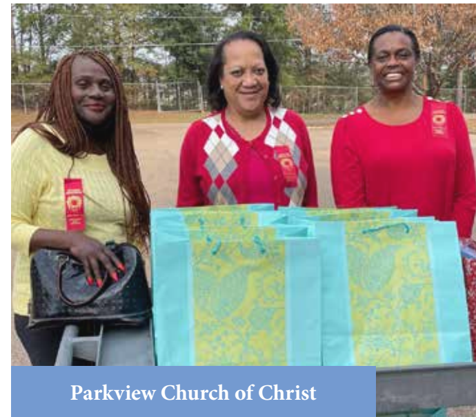
Parkview Church of Christ