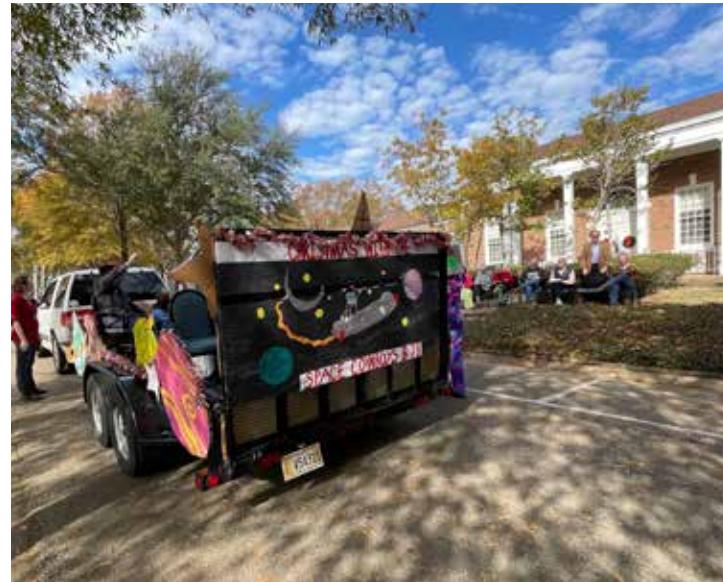
MSH's Rudolph's Friends Award went to Building 78, Christmas Space Cowboys.