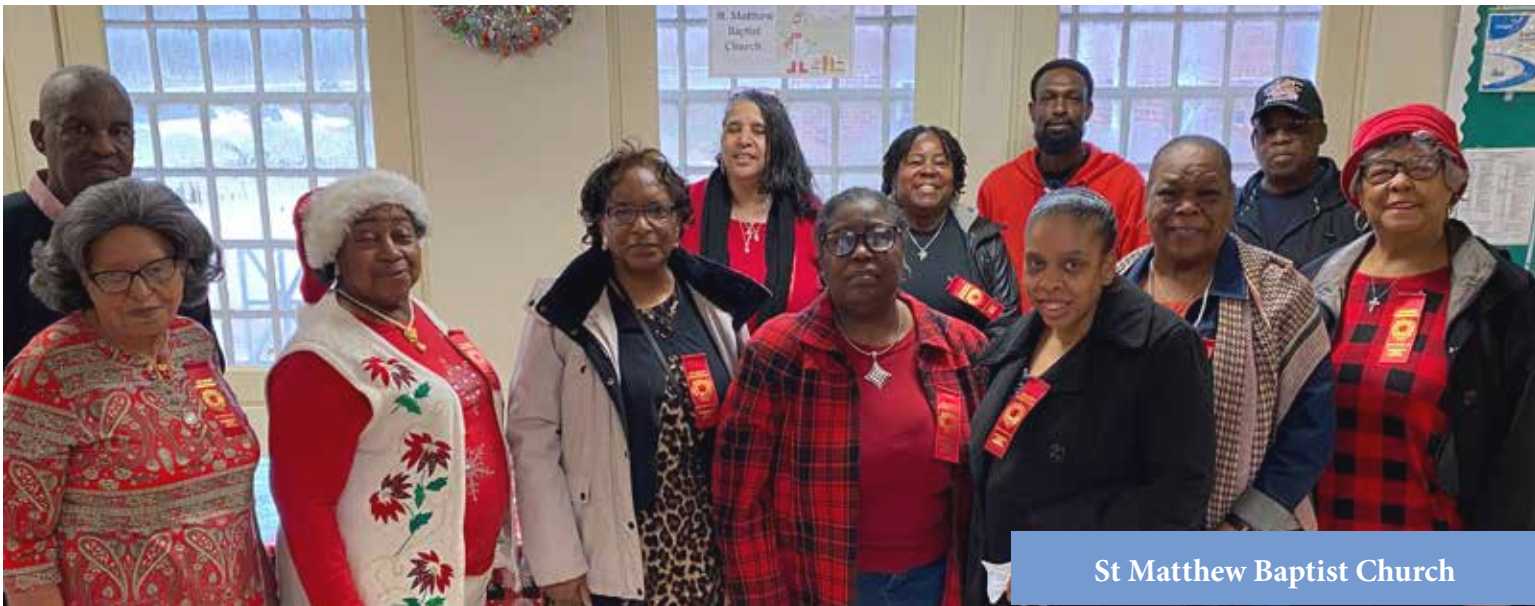
St Matthew Baptist Church