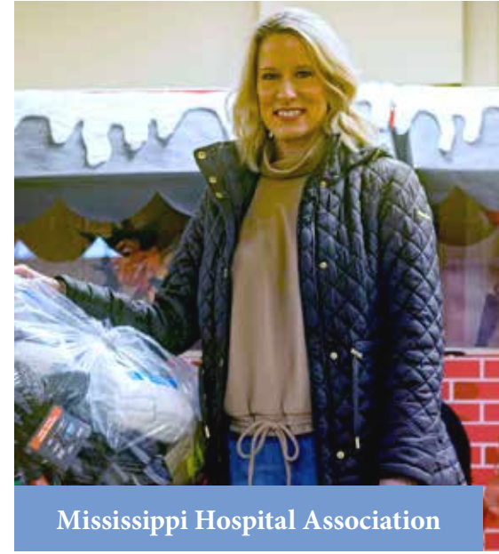
Mississippi Hospital Association