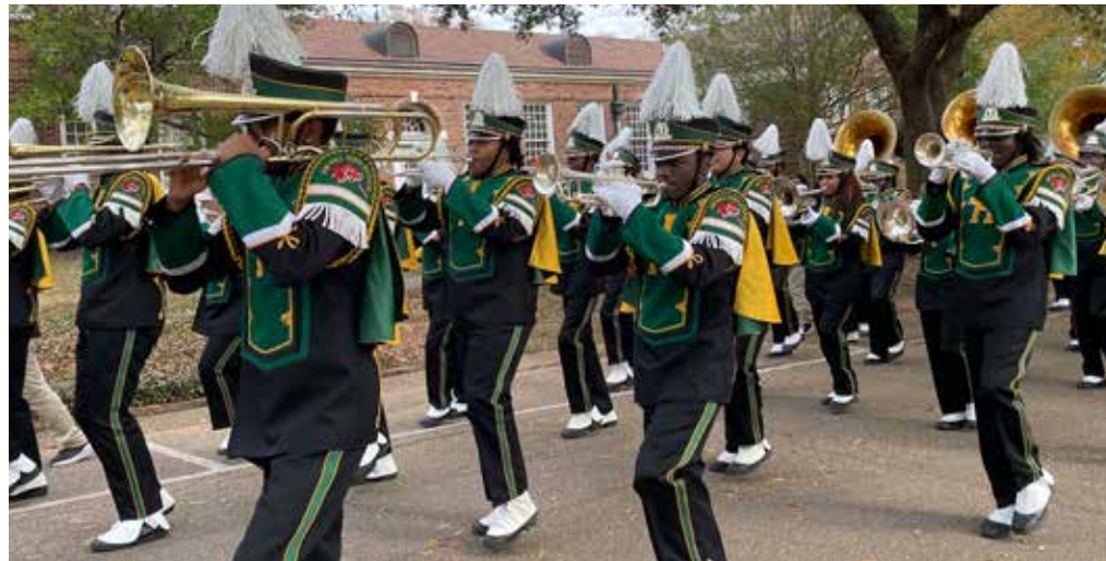
The Jim Hill High School Marching Band brass section marched in the Mississippi State Hospital Christmas Parade