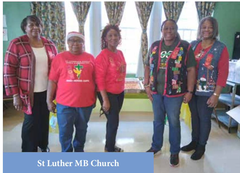
St Luther MB Church