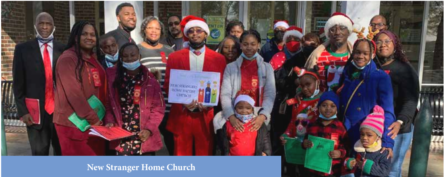
New Stranger Home Church