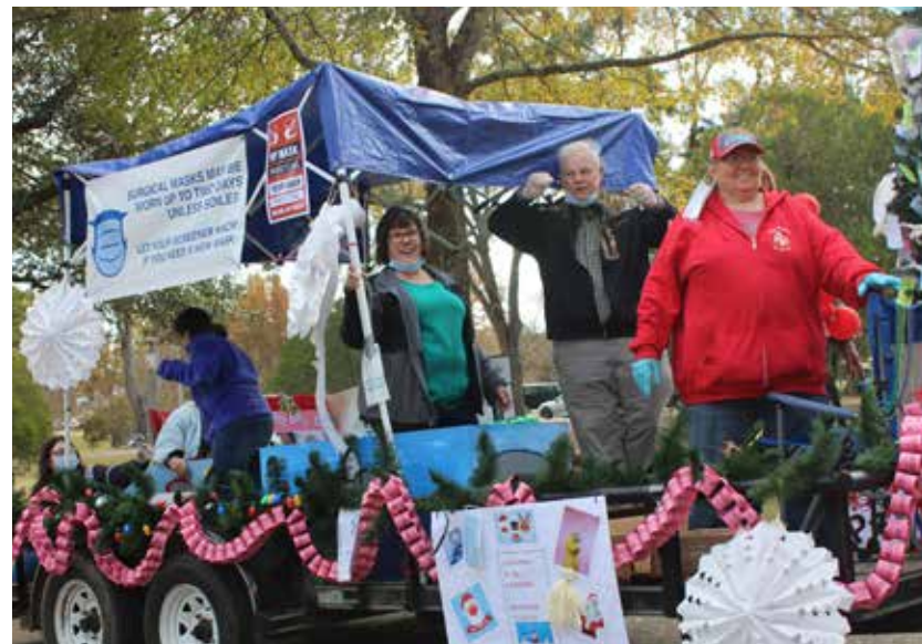
MSH's Judges Award went to Buildings 21/22/61, Christmas in the Pandemic.