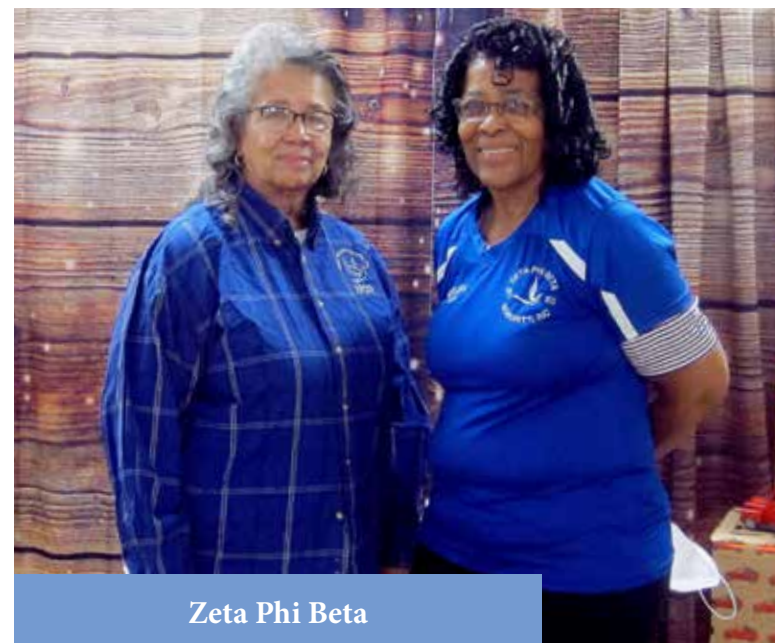
Zeta Phi Beta