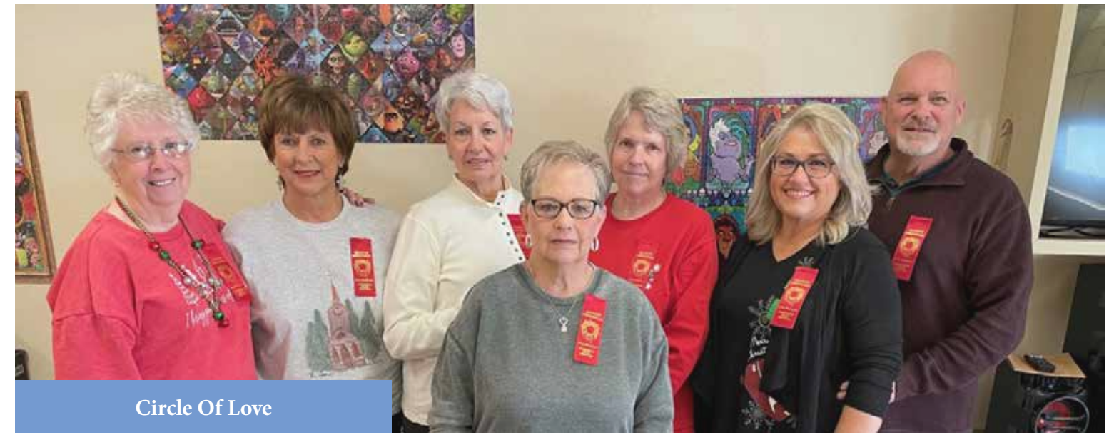
Circle Of Love