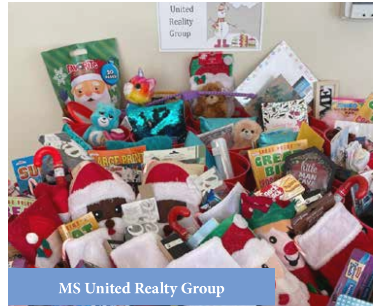
MS United Realty Group