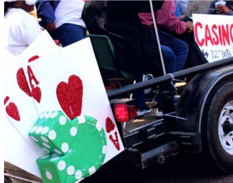
MSH's Christmas Star Award and Honorable Mention Award went to Buildings 87/90/43, Christmas in Vegas (Best in Show).