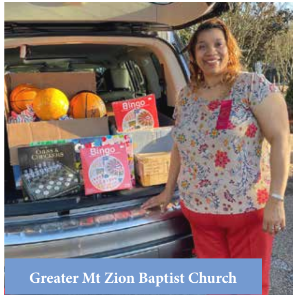
Greater Mt Zion Baptist Church