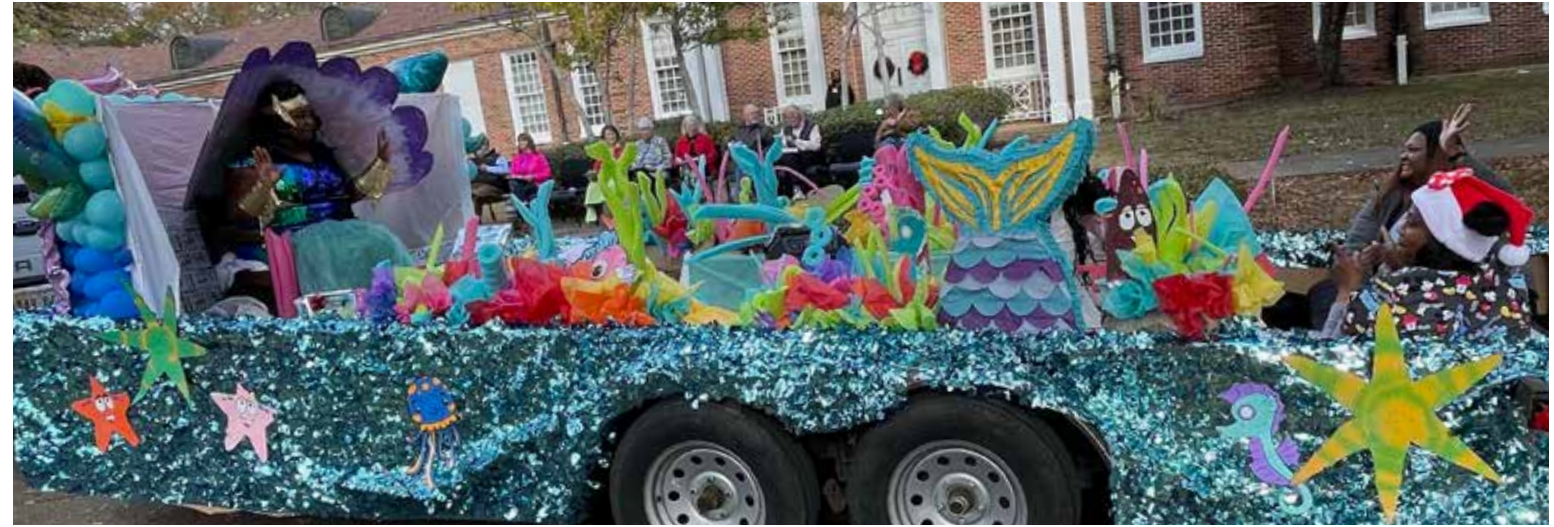
MSH's Holiday Magic Award went to Building 60, Under the Sea float (Best Parade Theme).