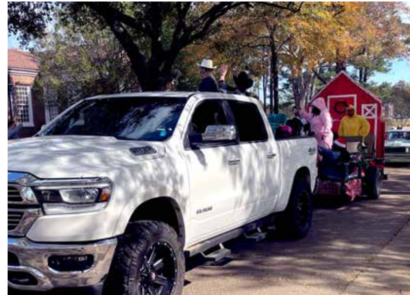
MSH's Fruitcake Award went to Building 45, Christmas on the Ranch.