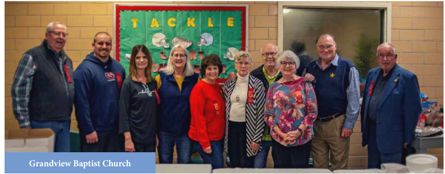
Grandview Baptist Church