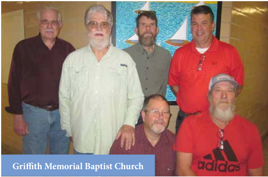
Griffith Memorial Baptist Church