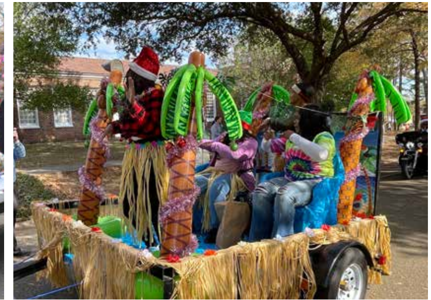
Honorable Mention awarded to Building 28/34, Christmas in Hawaii.