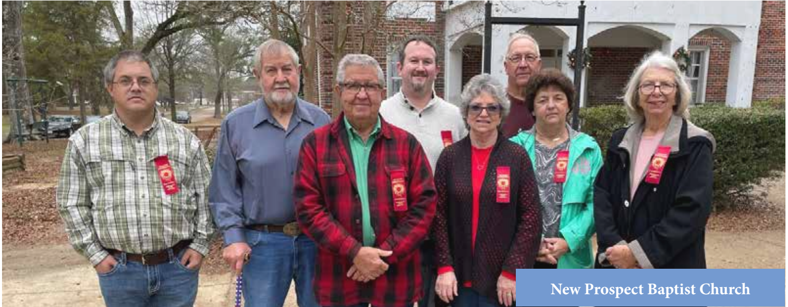
New Prospect Baptist Church