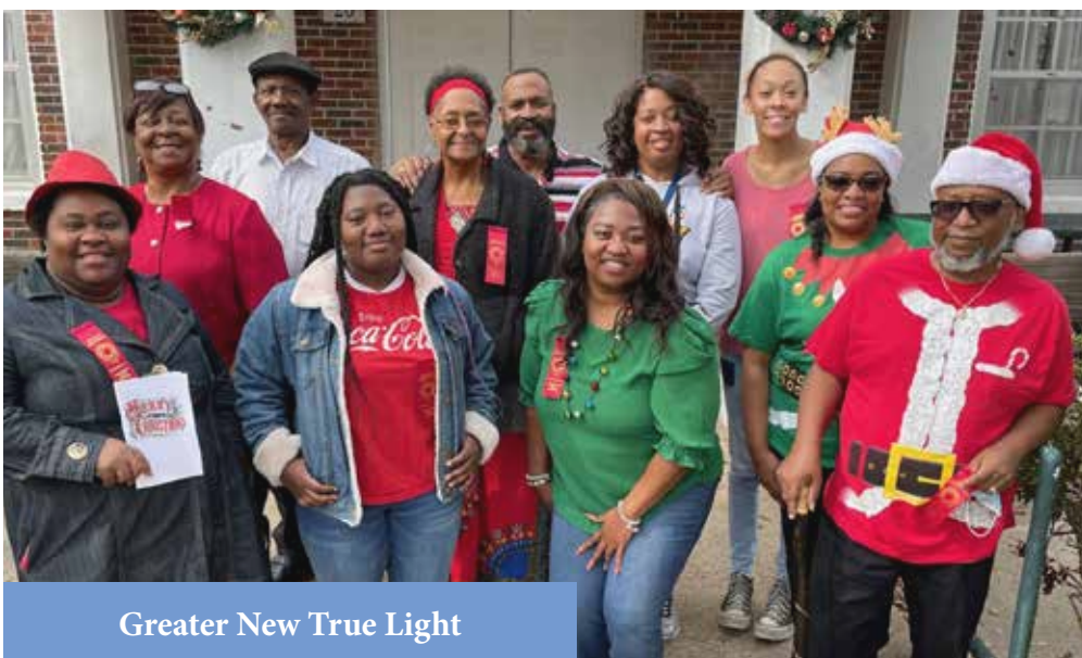
Greater New True Light